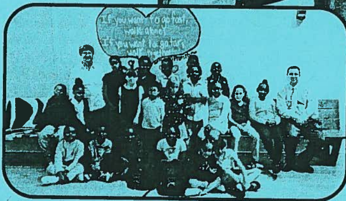
Just a few of our lucky winners!